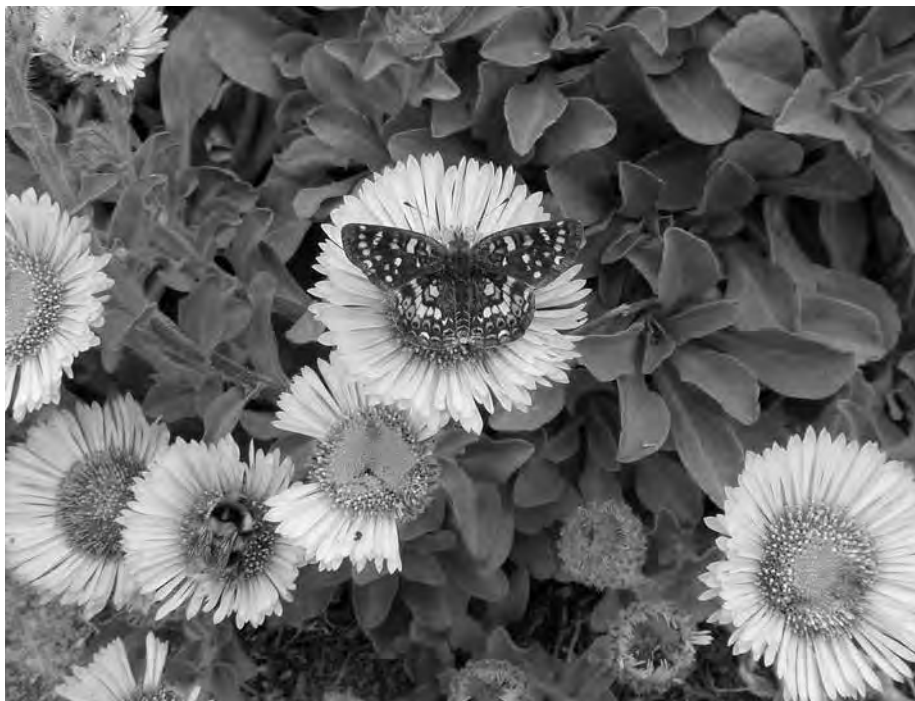
A bee and a butterfly stop to peruse the blooms along the trail.

of the Golden Gate, follow the paved path to the north, then return to the parking lot when ready. Three different paths depart to the south: one edging along Lincoln, the second where a driveway connects two segments of parking lots, and a third on the western edge of the second parking lot. All three join, but for this hike, take the middle path.