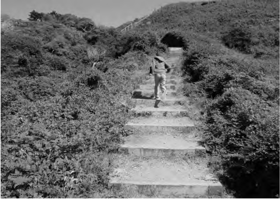
Batteries to Bluffs Trail ascends through lush coastal scrub.

one September visit, I was delighted to watch a pod of porpoises cavorting offshore. Explore the beach if you like; when ready, retrace your steps back to the junction with Batteries to Bluffs Trail, then turn right.