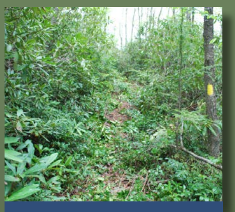
Friends of Blackwater West Virginia