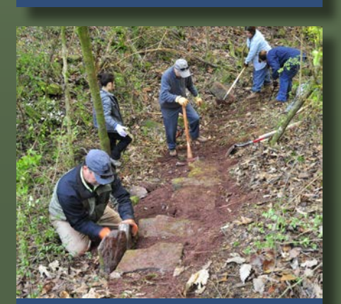
Red Mountain Park Alabama