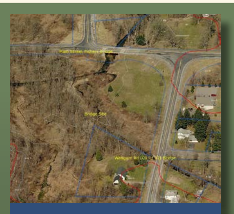
Victor Hiking Trail New York

L.L. Bean is a proud supporter of American Hiking Society's National Trails Fund. They have given hundreds of thousands of dollars in support of the National Trails Fund.