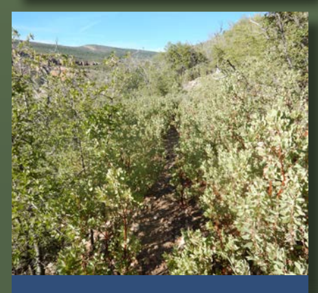
Arizona Trail Association Arizona