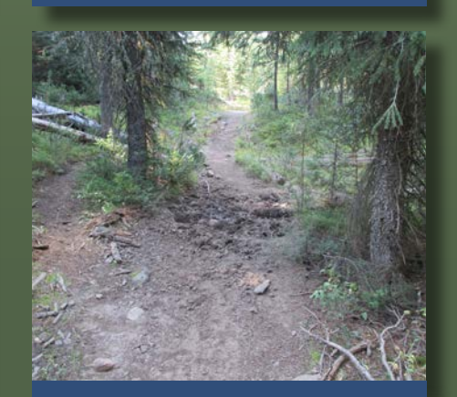
Absaroka-Beartooth Wilderness Foundation Montana