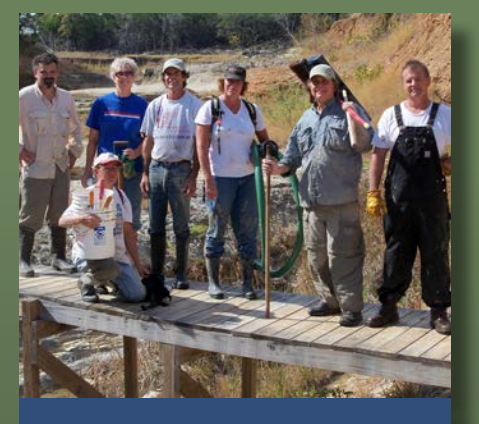
Gorge Preservations Society Texas